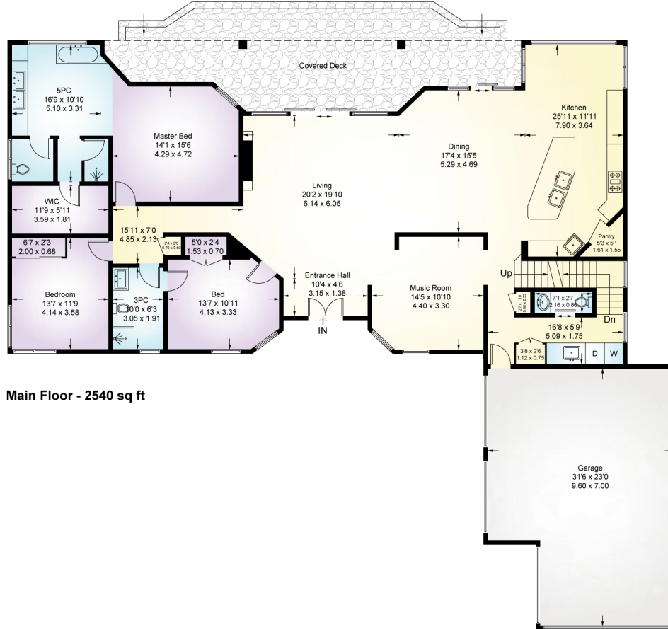
Main Floor - 2540 sq ft